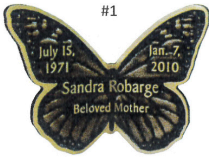
GB-AA-7033 Monarch Butterfly Shown as 5 3/4 " x 4 1/8 " black bronze.