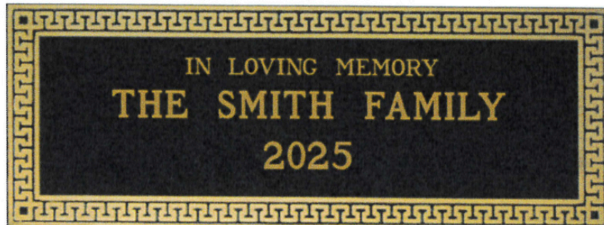
11" x 4" Bronze Memorial Plaque