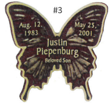
GB-AA-7034 Swallowtail Shown as 5" x 4 3/4 " Juneberry bronze.