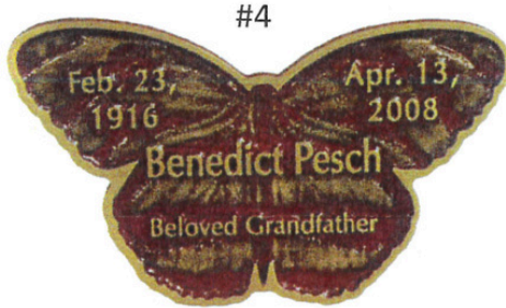
GB-AA-7037 Tiger Butterfly Shown as 6" x 3 1/2 " Cardinal Red bronze.