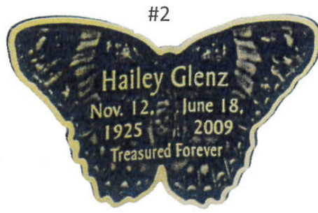
GB-AA-7035 Admiral Butterfly Shown as 6" x 3 3/4 " Indigo Blue bronze.